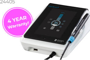
Cavitron® 300 #8161429