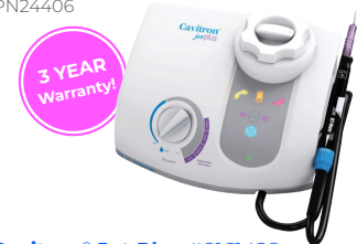
Cavitron® Jet Plus #8161428