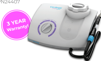
Cavitron® Prophy-Jet #8161427

Cannot be combined with any other offer.