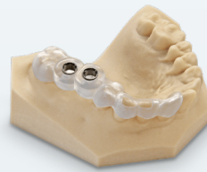
Implant surgical guides In development, coming soon