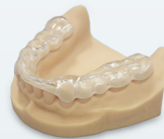
Night guards and bite splints 52 Guards in 186 minutes