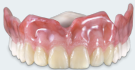
Monolithic and try-in dentures 14 dentures in 79 minutes