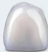
Temporary and permanent crowns 330 crowns in 32 minutes