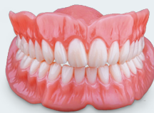
Full and partial dentures 18 dentures in 130 minutes