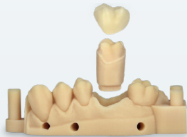
Dental crown and bridge quadrant models 46 quads in 61 minutes

Improve overall efficiency and turnaround time with Einstein Pro XL's reliability to deliver low cost-per-print, high-accuracy models, night guards, surgical guides, dentures, teeth, and more.