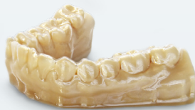
Full arch and orthodontic models 30 arches in 68 minutes